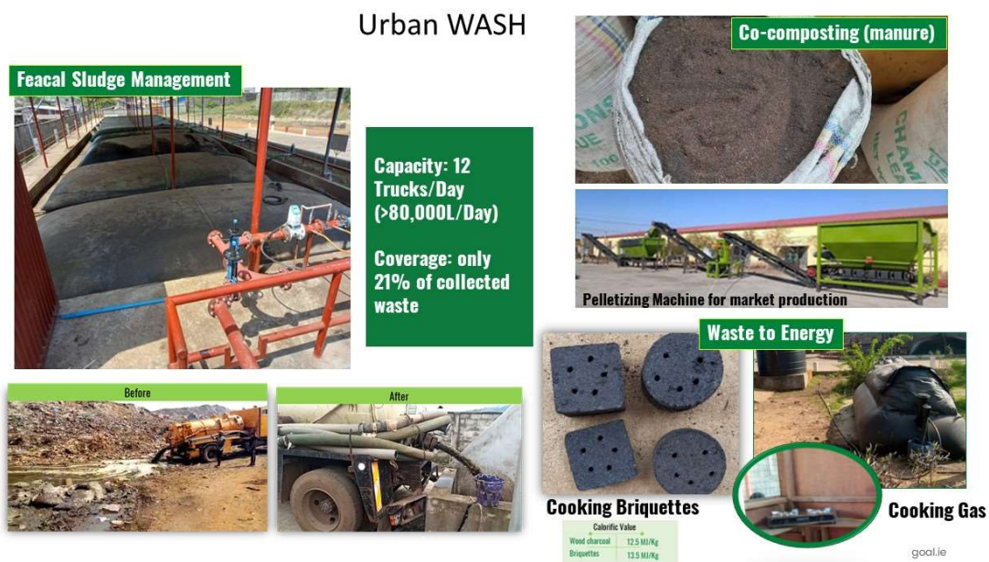
FSM Plant - Images from GOAL Board Visit, October 2023

Our pioneering Faecal Sludge Management (FSM) Plant in Freetown is now running at a total capacity of 12 trucks/day (>80,000l/day). A key element of our work in Freetown was innovation and research into how we could reuse the sludge generated at the plant. Our innovative approach is now seeing the plant producing GEObags, which can be used as fuel in the form of briquettes, pictured below.