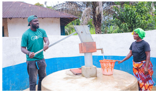
FSM Plant – Images from GOAL Board Visit, October 2023