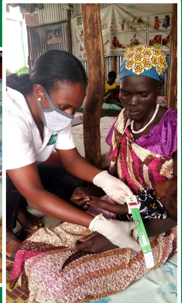
MUAC measurement by staff