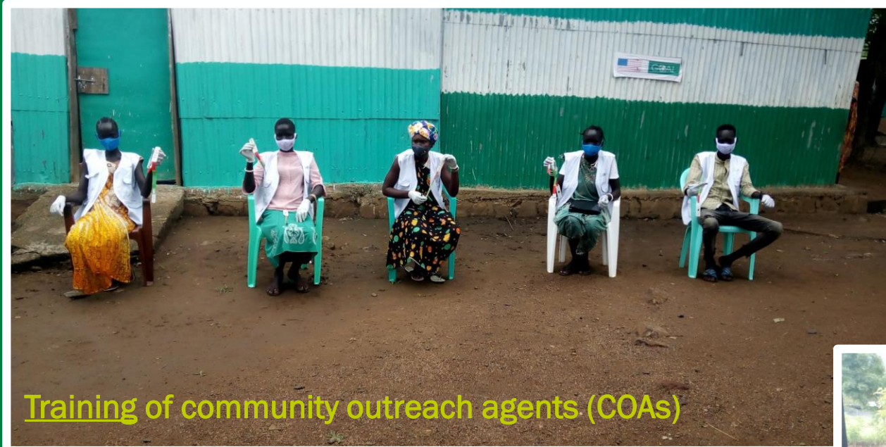
Training of community outreach agents (COAs)