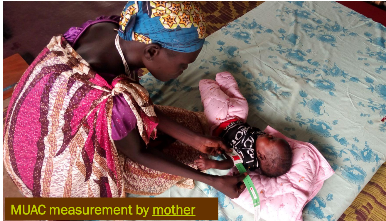
MUAC measurement by mother