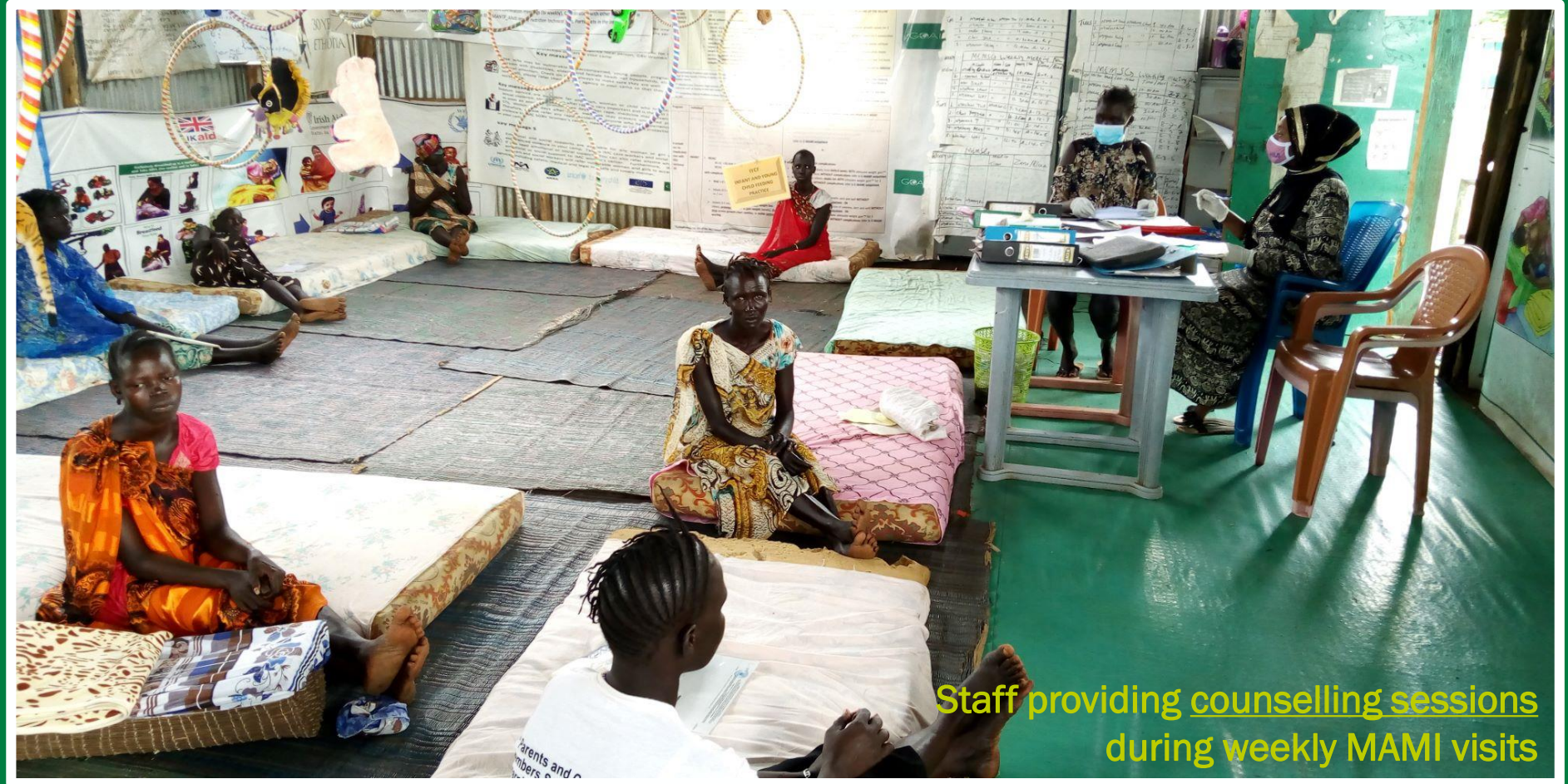
Staff providing counselling sessions during weekly MAMI visits