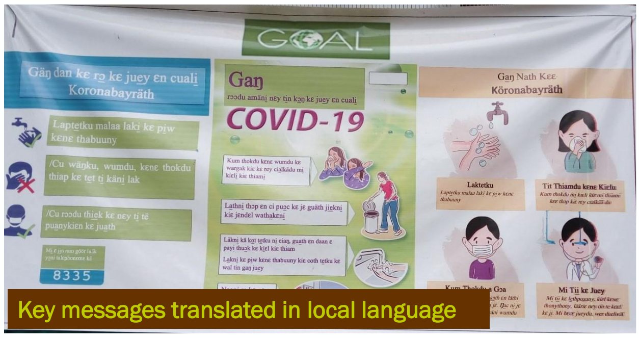
Key messages translated in local language