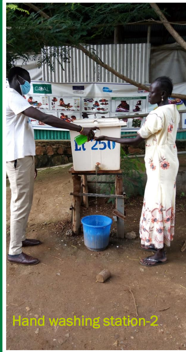
Hand washing station-2