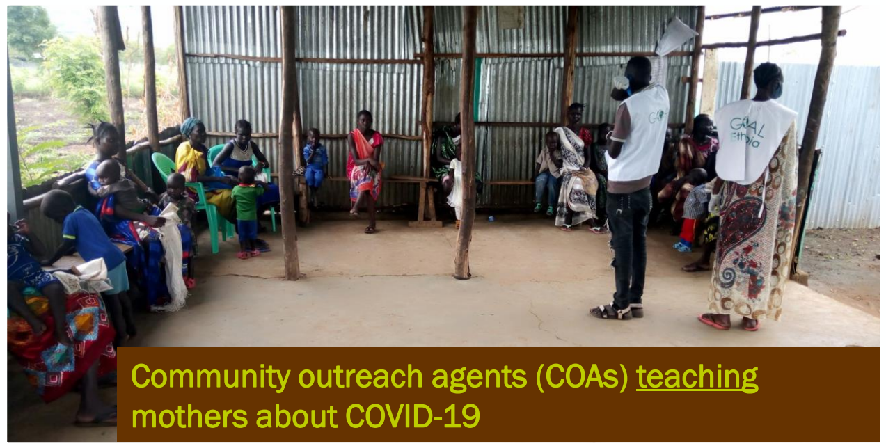
Community outreach agents (COAs) teaching mothers about COVID-19