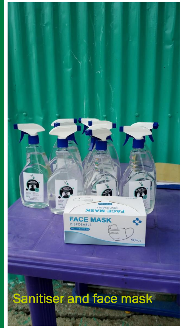
Sanitiser and face mask