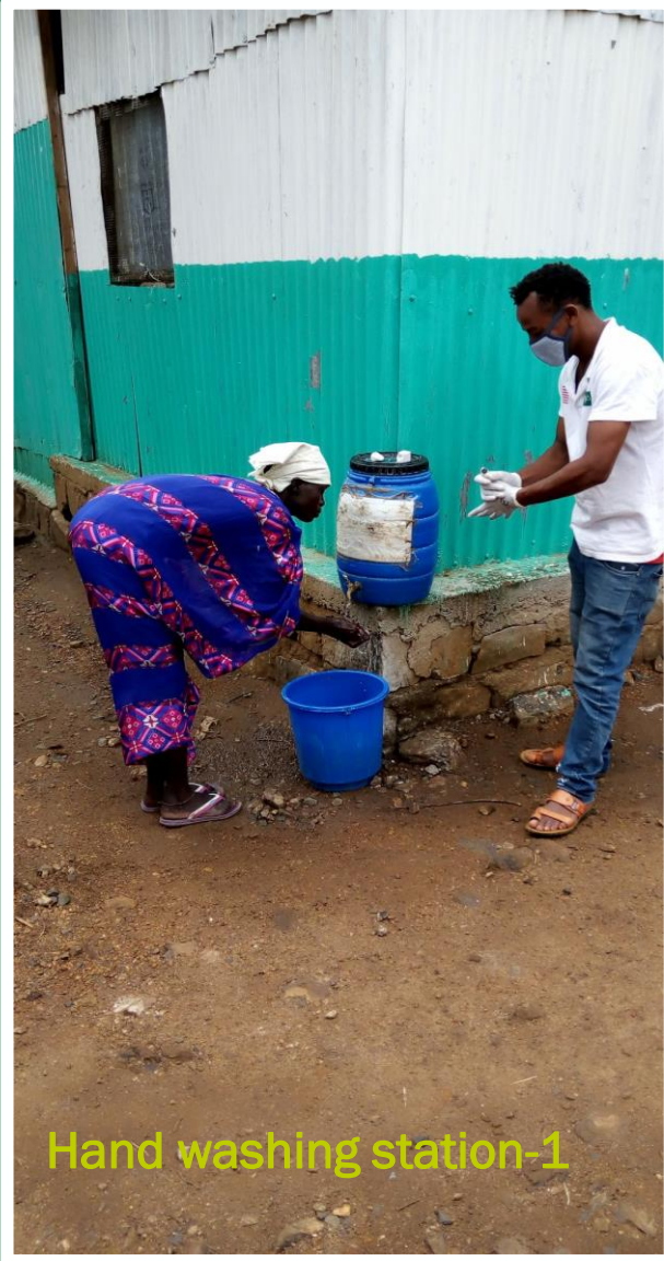
Hand washing station-1