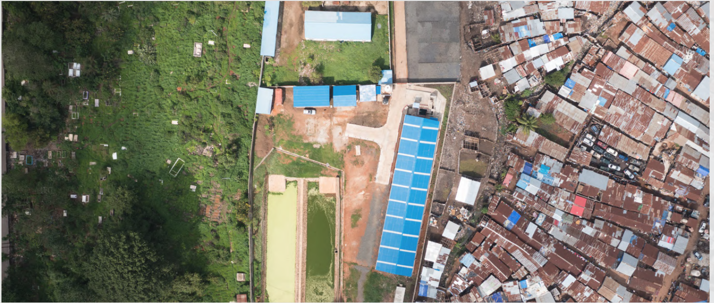
Kingtom, Sierra Leone

HomeBiogas is an established waste-to-energy method that has already had a significant impact globally in various contexts, including hard-to-reach areas proposed to be piloted in this innovation project in Sierra Leone. This complements GOAL's current urban WASH strategy.